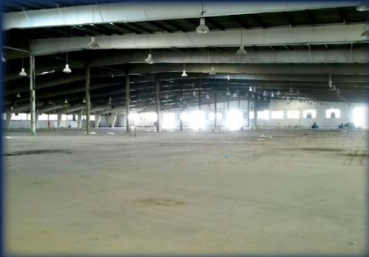
Project: Demolition and reconstruction of the warehouse shed Location: Tehran Operator: Digikal