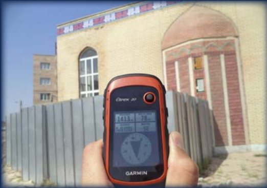
Project: Site acquisition (SA) Location: Tehran Operator: MTNI