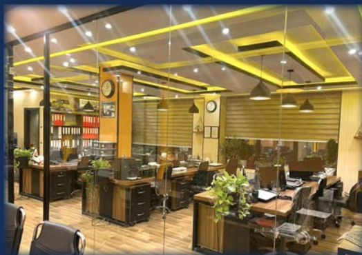
Project: Renovation and equip of the office building Location: Tehran Operator: PMI