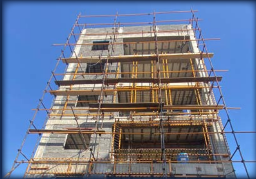
Project: Construction of a residential building Location: Ahvaz Operator: Personal