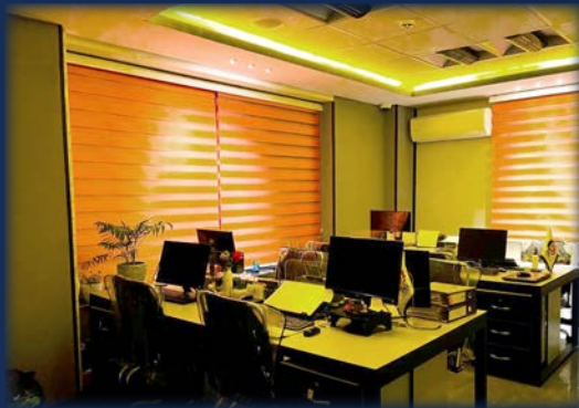
Project: Renovation and equip of the office building Location: Tehran Operator: PMI