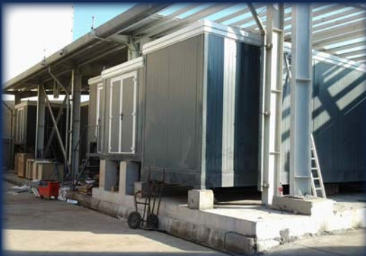
Project: Implementation of shed structure, buildings and foundation of telecommunications container Location: Ahvaz Operator: MTN