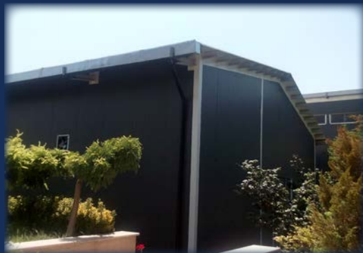
Project: Supply of equipment and construction of diesel generator and fuel tank shed of telecommunication site Location: Tehran Operator: MTNI