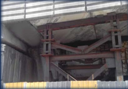
Project: Reinforcement of Be'sat Bridge Location: Tehran Operator: Tehran Municipality