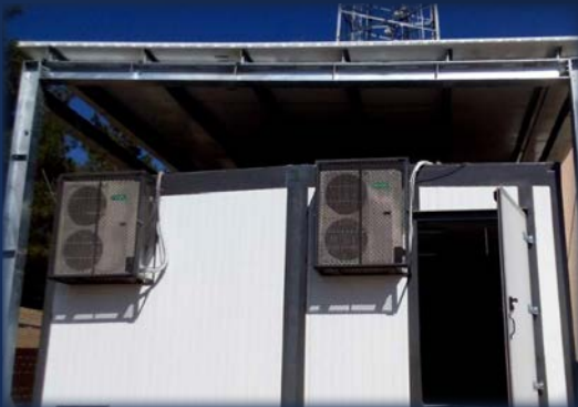
Project: Completion of BSC site Location: Zahedan Operator: MTNI