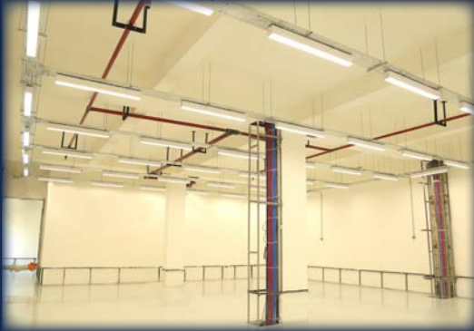
Project: Supply of equipment, optimization and development of Ramazani Telecommunication Center Location: Tehran Operator: MCI