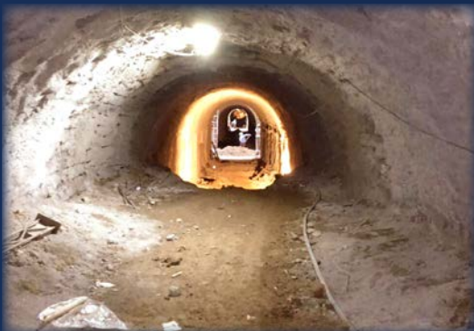
Project: Drilling operations and tunnel construction Location: Tehran Operator: Tehran Municipality