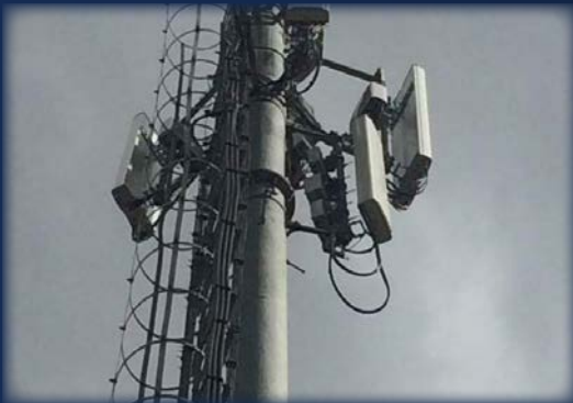
Project: Modernization of telecommunication sites (BTS-SWAP) Location: Tehran Operator: MTNI