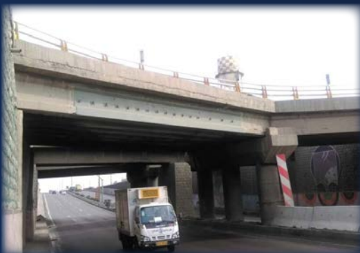
Project: Reinforcement of Fath-Depo Junction Bridge Location: Tehran Operator: Tehran Municipality