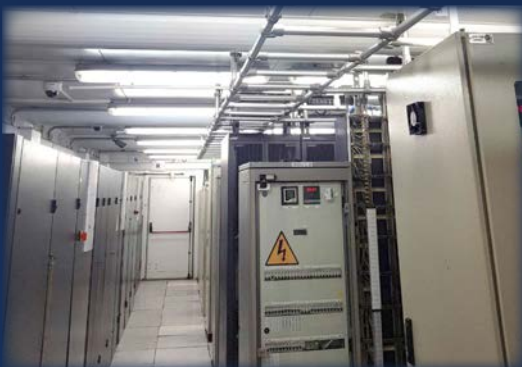
Project: Telecommunication containers laddering Location: Tabriz, Shiraz, Ahvaz, Karaj, Tehran, Babol, Esfahan, Mashhad Operator: MTNI