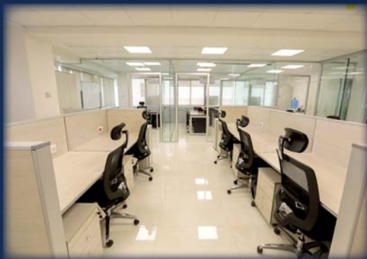
Project: Renovation and equip of the office building Location: Tehran Operator: Vista Media