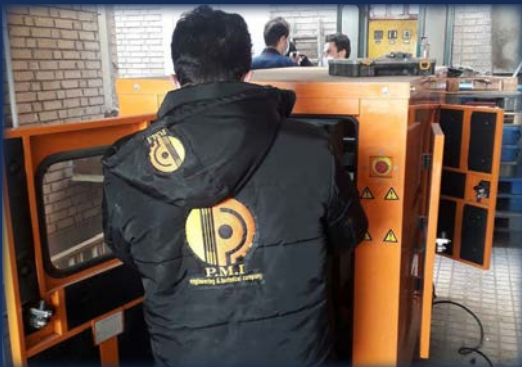
Project: Maintenance of diesel generator Location: Tehran Operator: Digikala