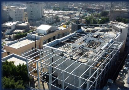
Project: Cooling system construction of telecommunication center Location: Ahvaz Operator: MCI