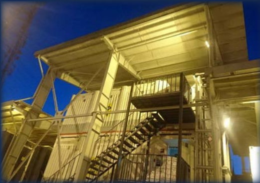
Project: Construction of data center and telecommunication equipment Location: Shiraz Operator: MTNI