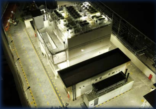
Project: Construction of data center and telecommunication equipment Location: Mashhad Operator: MTNI