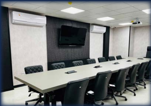
Project: Renovation and equip of the office building Location: Tehran-Alikhani Operator: MTNI