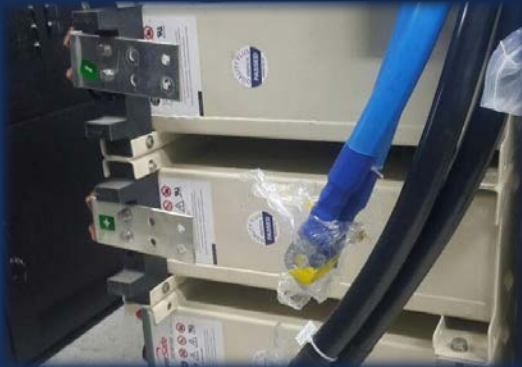
Project: Dummy Load test of UPS and rectifiers Location: Tehran Operator: MTNI