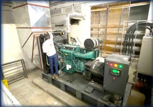
Project: Supply, installation and commissioning of diesel generator Location: Tehran Operator: Digikala