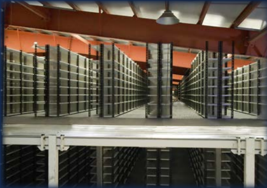
Project: Fulfilment center hall 1 mezzanine construction Location: Tehran Operator: Digikal