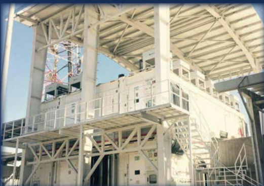
Project: Construction of data center and telecommunication equipment (T1) Location: Tehran Operator: MTNI