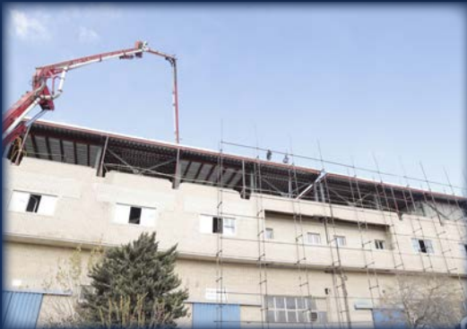
Project: Supply of equipment and construction of central administrative building Location: Tehran Operator: Iran Khodro Diesel