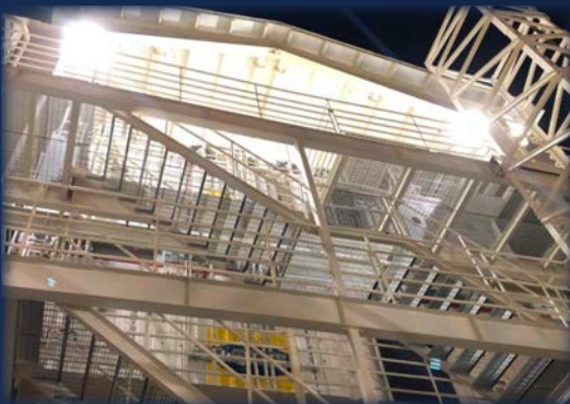
Project: Construction of data center and telecommunication equipment Location: Ahvaz Operator: MTNI