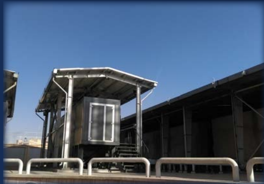
Project: Construction of transformer building, energy center structure and development of diesel generator shed Location: Isfahan Operator: MTNI