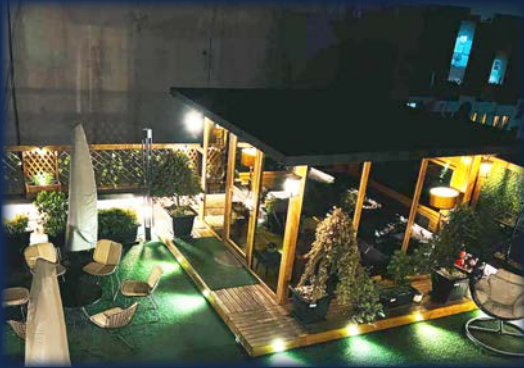
Project: Construction of roof garden Location: Tehran Operator: PMI