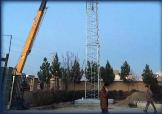
Project: Telecommunications (BTS) sites civil work Location: Tehran Operator: MCI