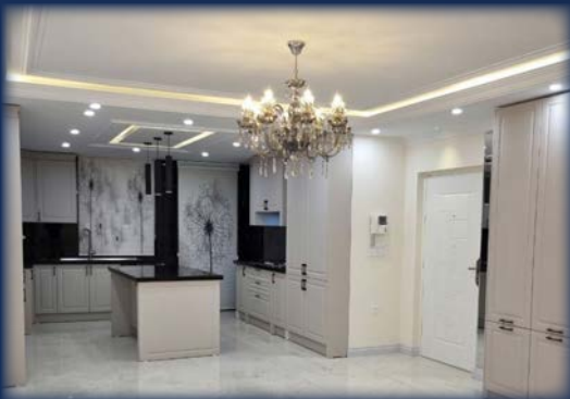
Project: Renovation of private building Location: Tehran Operator: Private